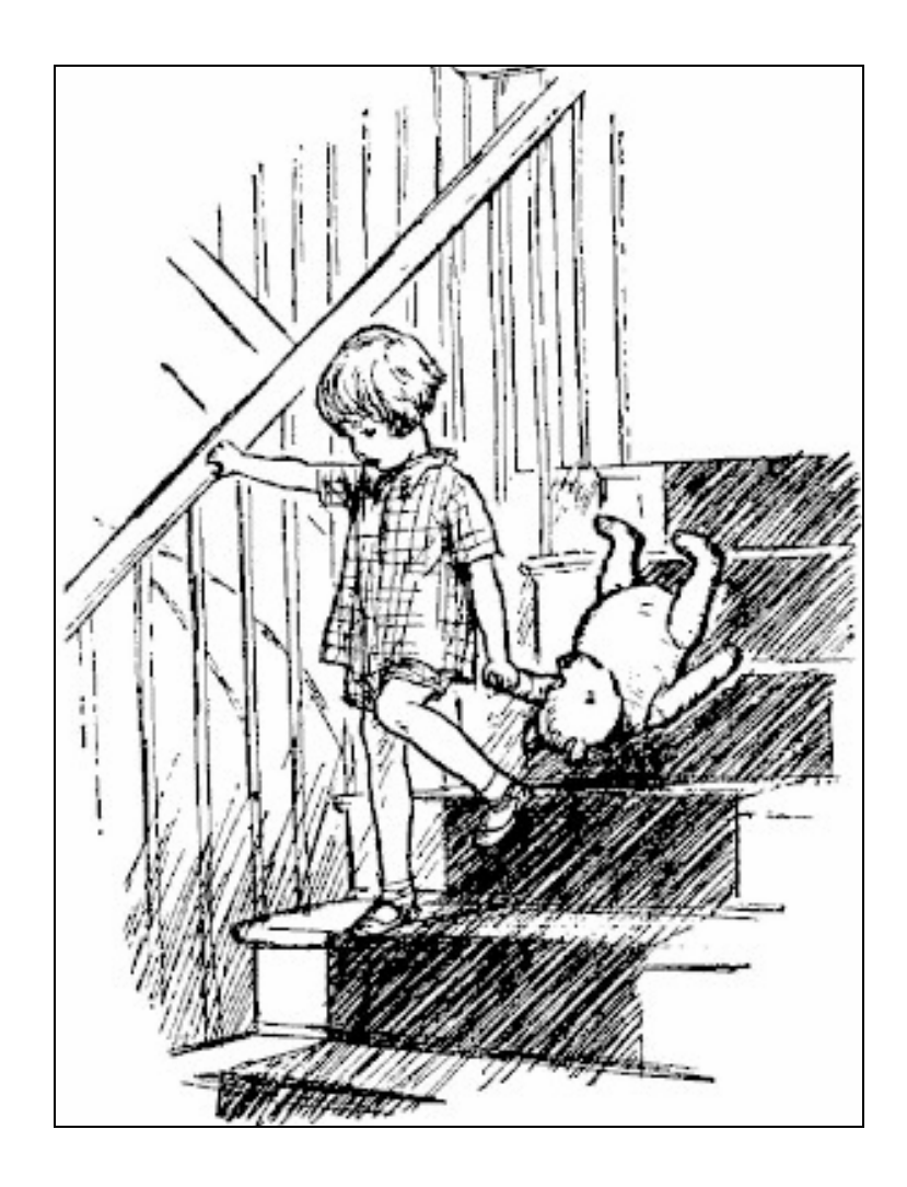
Winnie-the-Pooh and the Wrong Sort of Bees 12