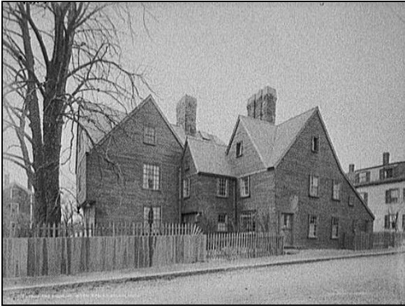
The House of the Seven Gables in 1915