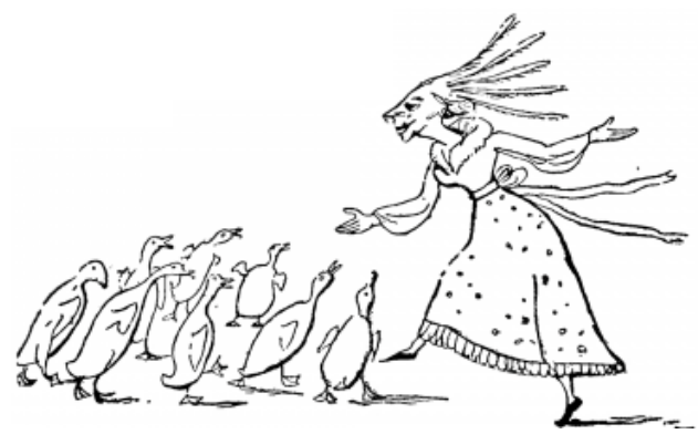
NARRATOR: (As Old Lady and Ducks mime actions.) There was an old lady of France, Who taught little ducklings to dance, When she said, "tick-a-tack," they only said, "Quack." Which grieved that old lady of France.