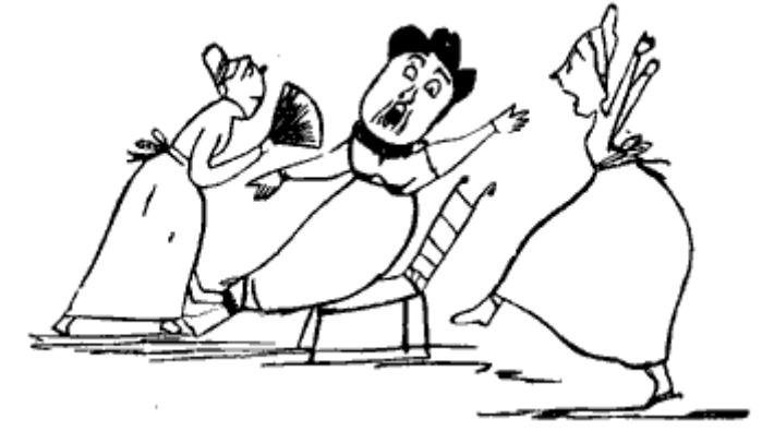
NARRATOR: (As Old Woman mimes actions.) There was an old lady of Russia, Who screamed so that no one could hush her, Her screams were extreme, no one heard such a scream, As was screamed by the lady of Russia.